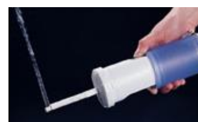
Hand held portable bidet

These hold water in a bottle and you can spray the water where needed. They are battery operated and can be carried with you. You need to be able to hold it in your hand and operate the button.