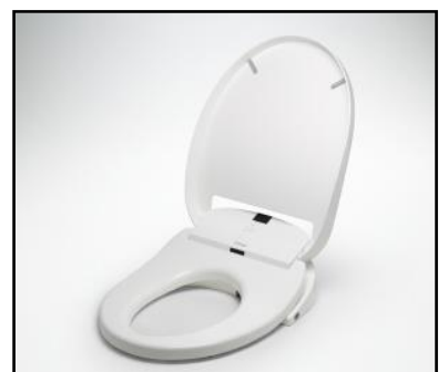
Electronic Bidet Toilet Seat

To operate a bidet you need to use buttons and controls. If this is difficult, some bidets can be adapted. For details, contact ILC Tas.