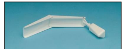
Homecraft Folding Bottom Wiper