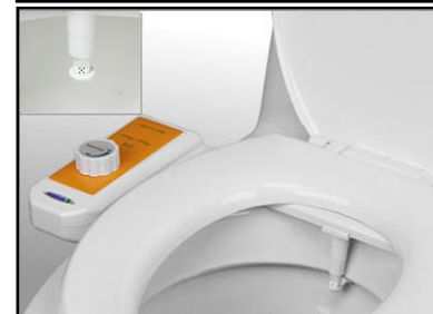
Cold water spray

These are sprays mounted on the toilet bowl under the seat. They are usually cheaper than warm water sprays and bidets as they do not need hot water or a power point. However the water is cold and may not be suitable for colder climates.