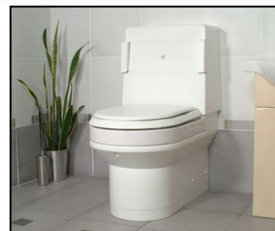
Combined toilet and bidet

They cannot be fitted to an existing toilet. You may need to replace your toilet.